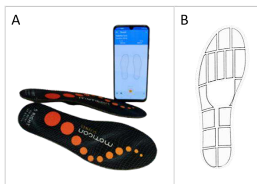
Figure 1. (A) The Insole3 (Moticon ReGo AG, Munich, Germany) and the OpenGo smartphone application. (B) Layout of the 16 pressure sensors and coordinate system. Figure 1B used and modified with permission from Moticon ReGo AG.

Such technologically advanced insoles greatly improve their utility in rehabilitation science and in conducting studies in ecologically valid environments including the home and community [13]. These features are especially useful for evaluative diagnostics, particularly in patients with abnormal force parameters contributing to disease progression, pain, morbidity, and reduced quality of life. Another novel feature of the Insole3 device is the addition of real-time audio feedback capability via Bluetooth connectivity to a smartphone, which can be used as a tool to assist in modifying gait patterns [12] and vGRF [14] in patients for whom excess force parameters are a concern, such as in those with musculoskeletal disorders. However, prior to being used for these applications, such an insole must be validated to confirm that it accurately estimates force.